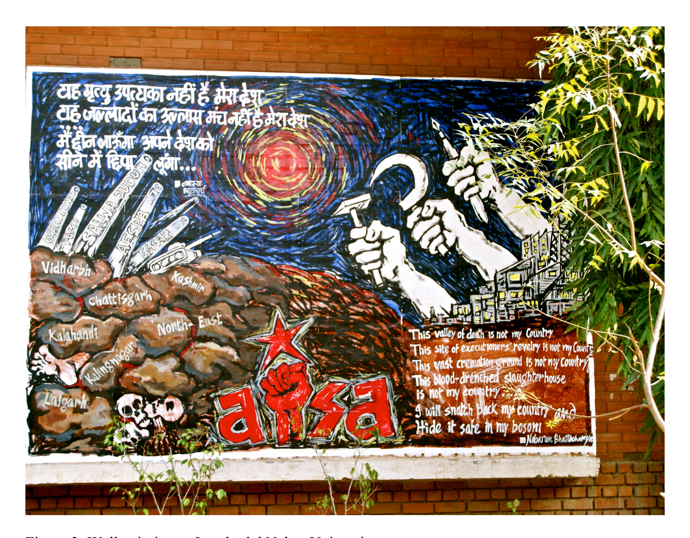
Figure 3: Wall painting at Jawaharlal Nehru University.

wall paintings criticize communists, Naxalites, and Marxists, exhorting "no glory for Marxists" and spurring students on to action: "When communism is the enemy, it is a crime not to fight."