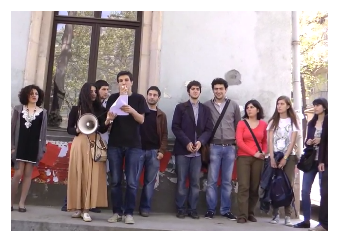
Figure 2. Some of the Laboratory 1918 activists reading the manifesto.

activists as "revolutionary secretaries (Sargent, 1981)." Since its inception, gendered patterns were infused in the activism of Laboratory 1918.