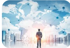
Economics and Business