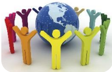
Social and Political Sciences